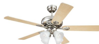
Reversible Light Maple Finish Blades