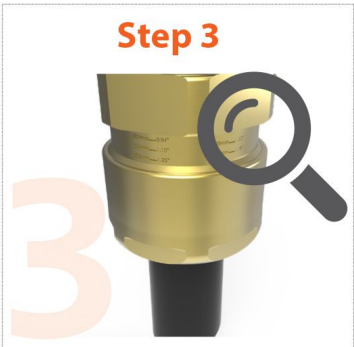
The backnut should be level with the marking guide corresponding to its diameter – this can be visually inspected and adjusted as necessary