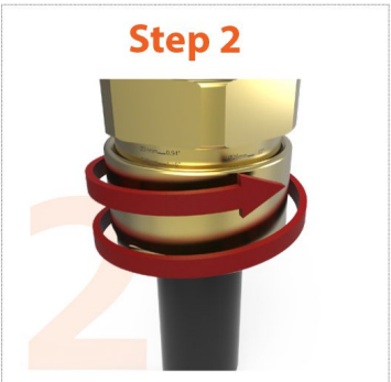
Tighten backnut until a seal is formed onto the cable, then tighten one further turn