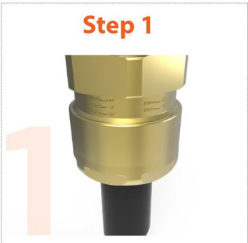
Follow cable gland installation instructions until final stage – tightening of rear seal

The gland is permanently marked with various lines/numbers indicating the correct tightening level related to the cable diameter. Following the relevant cable gland Installation Instructions, the back seal should be tightened until a seal is formed on the cable outer sheath and then tightened one further turn.